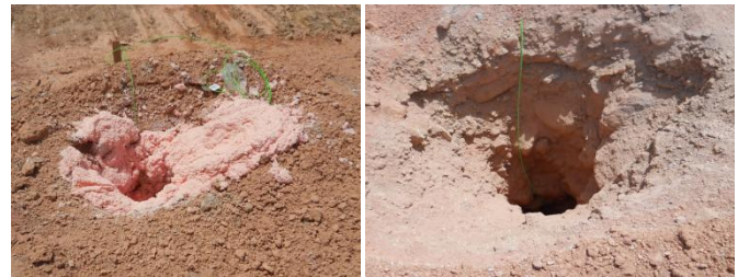
Figure 2 (L-R) Heavy ANFO after loading vs. \Delta E after loading

Titan \Delta E 1000 has excellent water resistance. As a result, it limits the amount of ammonium nitrate that can dissolve in run-off and groundwater. The Heavy ANFO bulk delivery trucks left roughly 6% of the total powder weight loaded around the collar, which makes it available to contaminate groundwater. Titan \Delta E 1000 eliminated this problem with bottom up loading.