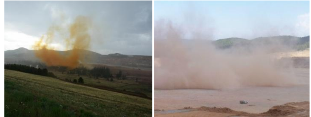
Figure 1 (L-R) Baseline blast fumes vs. Titan \Delta E blast fumes

Post blast NO x fumes were readily apparent when the mine's normal Heavy ANFO blends were used in rock that was damp, wet, and unconsolidated. The Titan \Delta E 1000 blasts showed no visual signs of NO x in any areas.